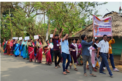
IEC Activity (Rally) on Social Audit